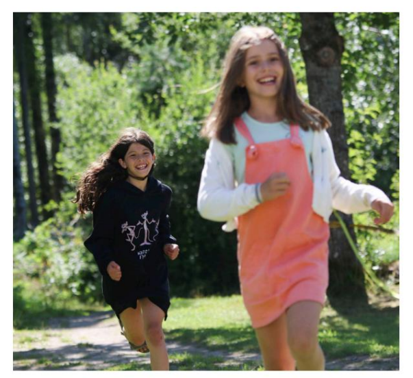
"IT'S SO FUN TO THINK THAT NOW MY GRANDSON TOO IS A STØA-BOY! ... AND HE HAD MET A ROA-GIRL, JUST LIKE ME." QUOTE FROM A GRANDFATHER